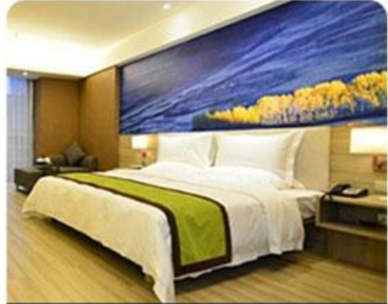
Business Travel Hotel